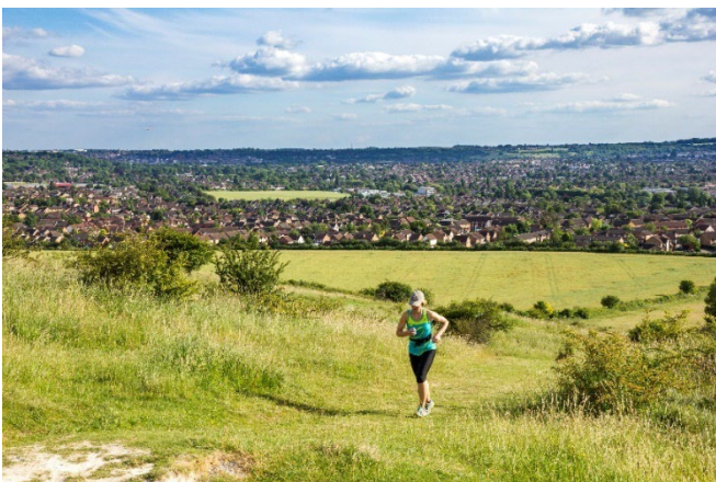
Galley & Warden Hills on the edge of Luton

A project advisory group is being established to help steer the project locally within Luton. Members of this group are likely to include youth ambassadors, representative local community groups, Luton Borough Council, the University of Bedfordshire, the River Lea Partnership, Marsh Farm Outreach, BCN Wildlife Trust and Luton Youth Network. We will have a flexible approach to membership, as things progress there may be opportunities to involve new members on to the Advisory group who will benefit and add value to the project. Contact: aweiss@chilterns.org.uk