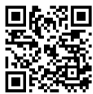
FiPL in National Landscapes