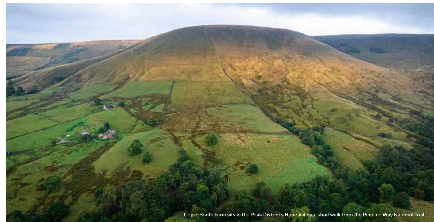
Upper Booth Farm sits in the Peak District's Hope Valley, a shortwalk from the Pennine Way National Trail