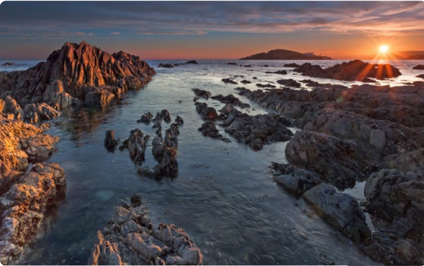
South Devon National Landscape – Wild Bantham Beach