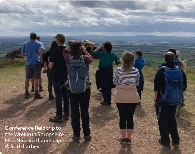
Conference field trip to the Wrekin in Shropshire Hills National Landscape

The National Landscapes Association is dedicated to equipping our teams with essential skills. Over 40 staff in National Landscapes in Wales completed Carbon Literacy training to help reduce their carbon footprints; we hope to roll this out to National Landscapes teams in England.