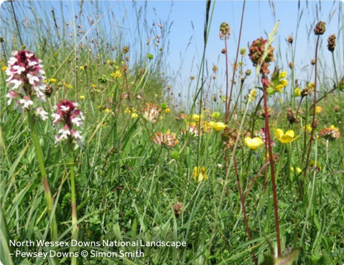
North Wessex Downs National Landscape -Pewsey Downs

Our work in advancing nature recovery continues to gain momentum. 30by30 support: Analysis and data sharing with Defra laid the groundwork for National Landscapes to understand the scale of the task and likely resource needs to protect significant portions of their areas effectively. Nature recovery principles: The establishment of principles for incorporating nature recovery into management plans strengthens their role in nature recovery and their links to local nature plans.