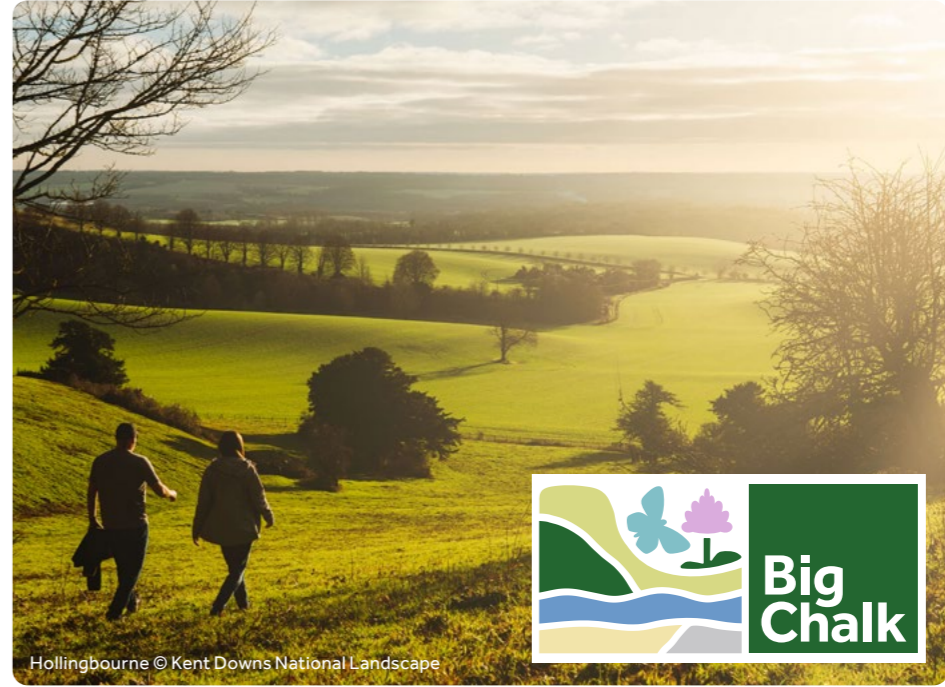
Hollingbourne

"Collaboration is at the heart of what we do and must continue to do – it's the key to achieving a truly connected, thriving natural landscape. The challenge is immense, but with bold, landscape-scale thinking, such as that embodied by Big Chalk, we can rise to meet it." Professor Sir John Lawton, author of the Making Space for Nature report 2010