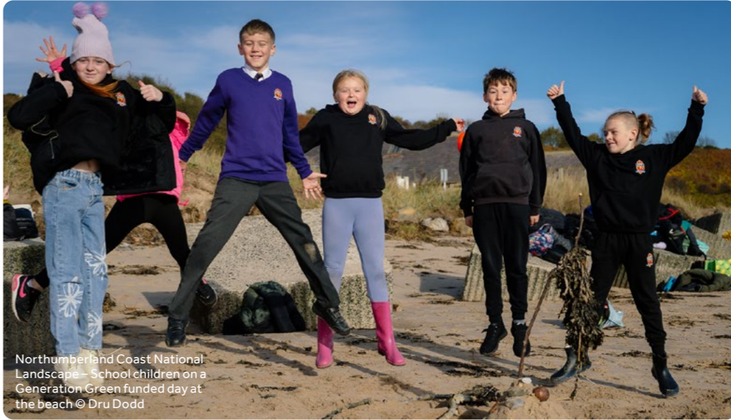
Northumberland Coast National Landscape – School children on a Generation Green funded day at the beach

"That was the best school day ever, I wish we could sleep here." Generation Green participant, Northumberland Coast National Landscape.