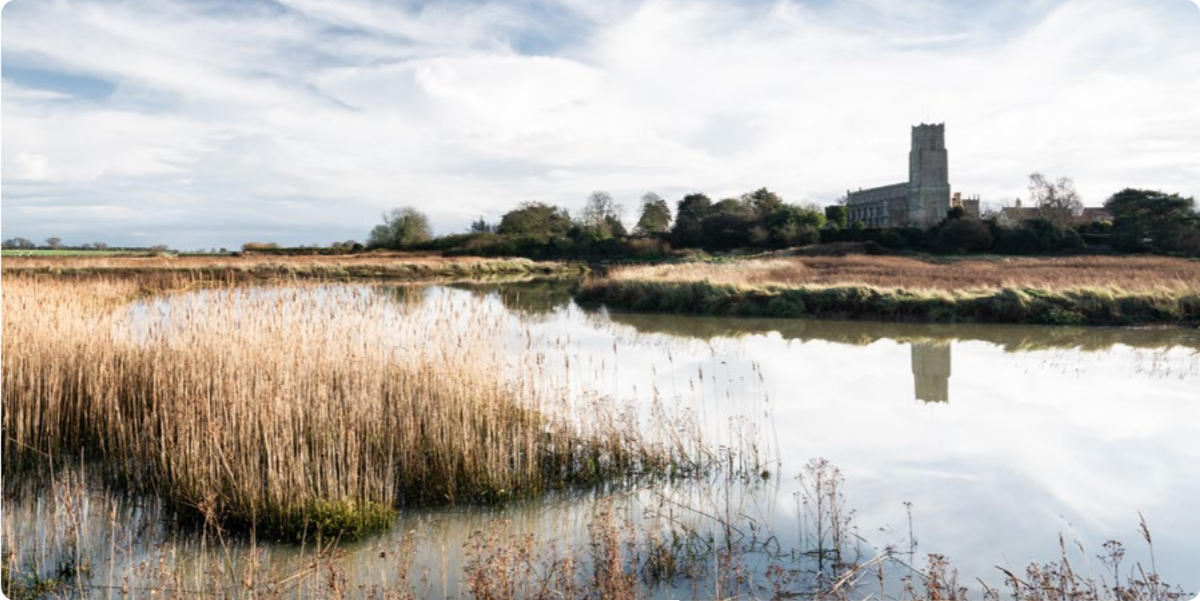
Suffolk & Essex Coast & Heaths – Blythburgh