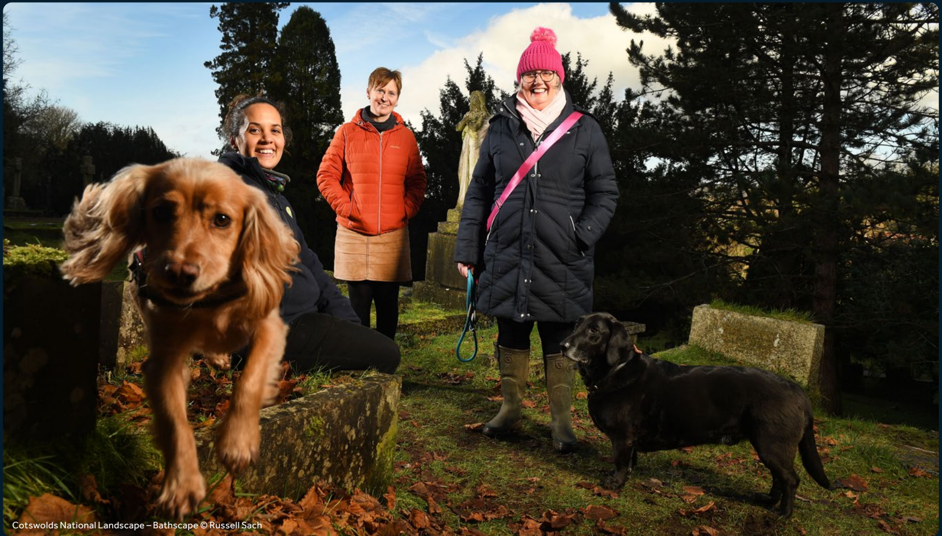
Cotswolds National Landscape – Bathscape