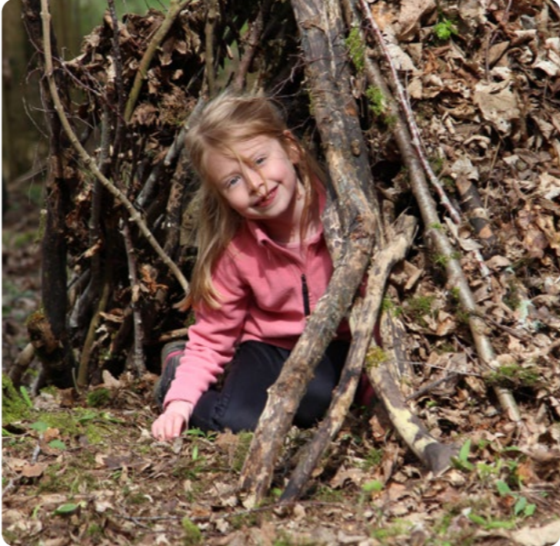
Arnside & Silverdale National Landscape – Woodland Fun Day