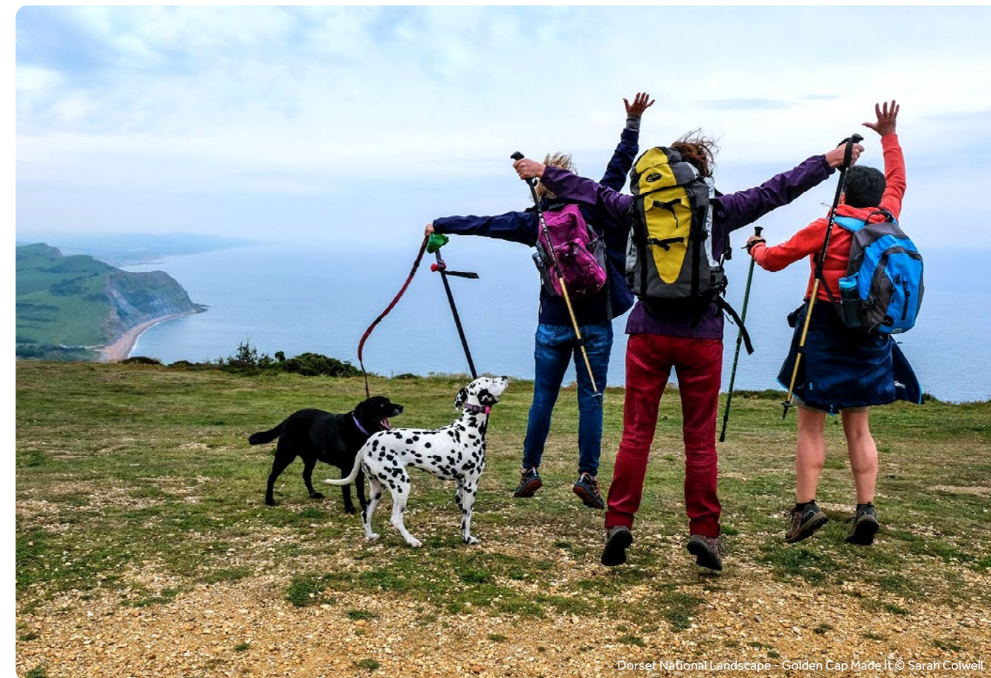
Dorset National Landscape - Golden Cap Made It

We will maximise our contribution and impact by being a respected and influential voice which draws on experience and evidence to make and influence national and regional policy and practice. We will shape debate and seek innovation, learning, and solutions.