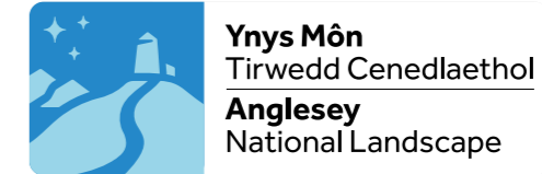
Ynys Môn Tirwedd Cenedlaethol Anglesey National Landscape