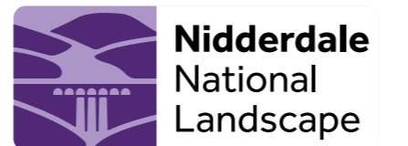
Nidderdale National Landscape