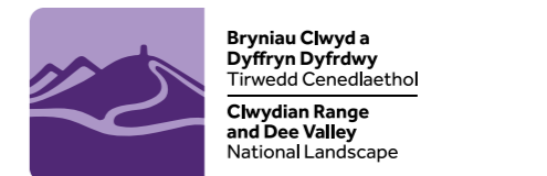
Bryniau Clwyd a Dyffryn Dyfrdwy Tirwedd Cenedlaethol Clwydian Range and Dee Valley National Landscape