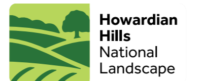
Howardian Hills National Landscape