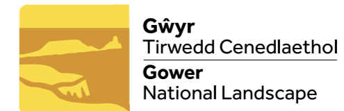
Gŵyr Tirwedd Cenedlaethol Gower National Landscape