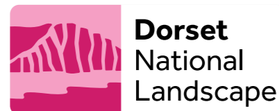
Dorset National Landscape