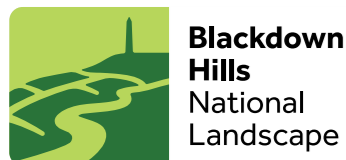
Blackdown Hills National Landscape