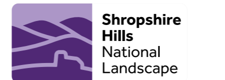
Shropshire Hills National Landscape