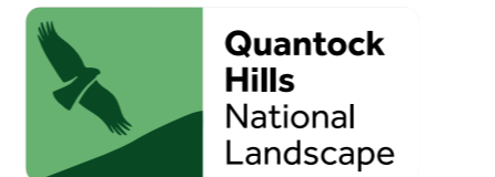
Quantock Hills National Landscape