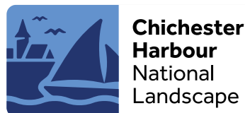
Chichester Harbour National Landscape