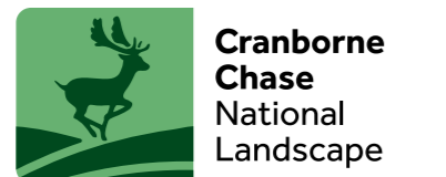
Cranborne Chase National Landscape