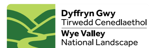
Dyffryn Gwy Tirwedd Cenedlaethol Wye Valley National Landscape