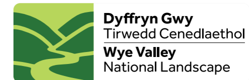
Dyffryn Gwy Tirwedd Cenedlaethol Wye Valley National Landscape