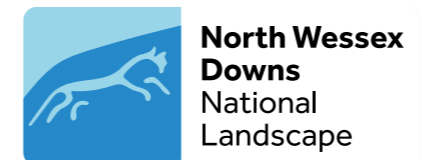
North Wessex Downs National Landscape