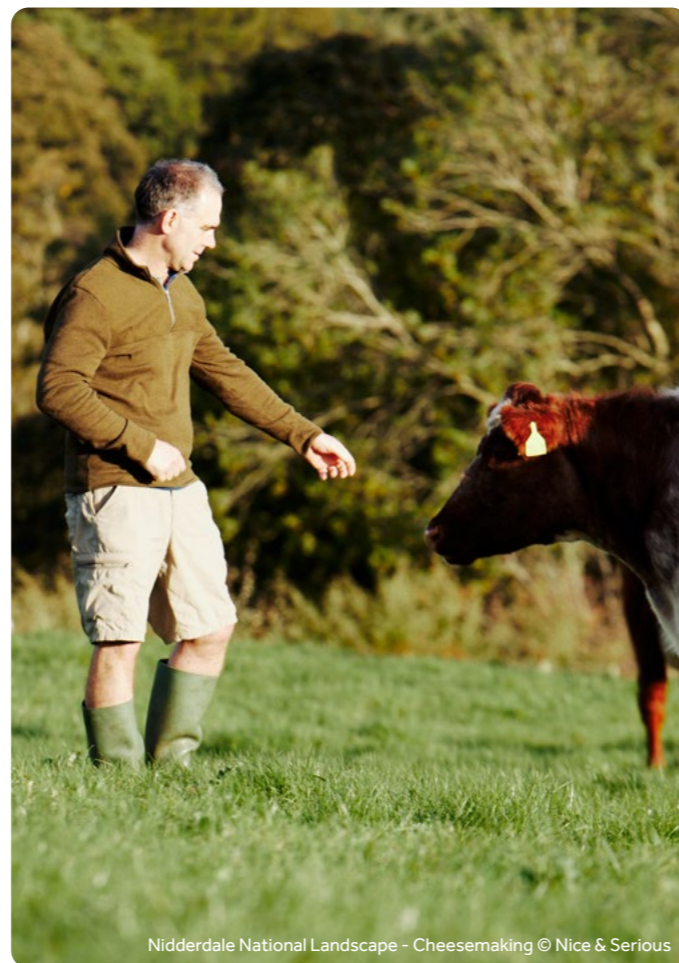
Nidderdale National Landscape - Cheesemaking

We will champion the interests of National Landscapes with governments, and coordinate the delivery of national projects.