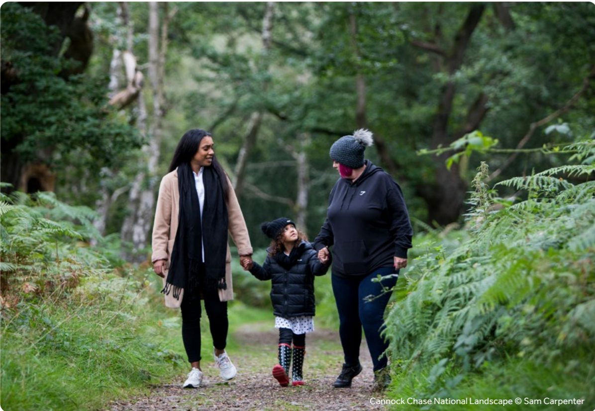
Cannock Chase National Landscape

The way we work and everything we do will be underpinned by our values. The National Landscapes Association is: