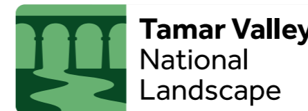
Tamar Valley National Landscape