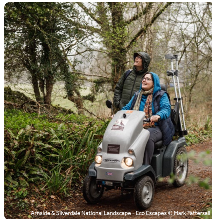
Arnside & Silverdale National Landscape - Eco Escapes