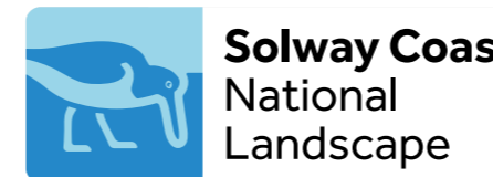
Solway Coast National Landscape