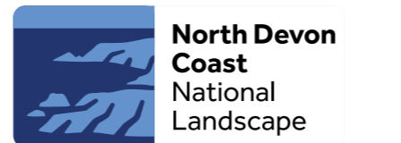
North Devon Coast National Landscape