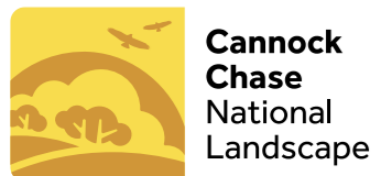
Cannock Chase National Landscape