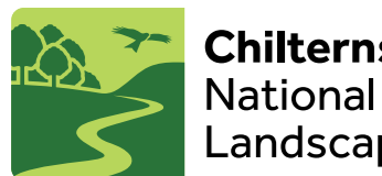
Chilterns National Landscape