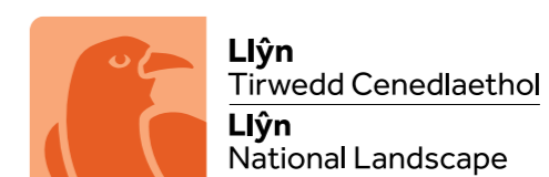
Llŷn Tirwedd Cenedlaethol Llŷn National Landscape