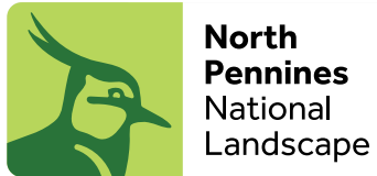
North Pennines National Landscape