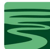
Norfolk Coast National Landscape