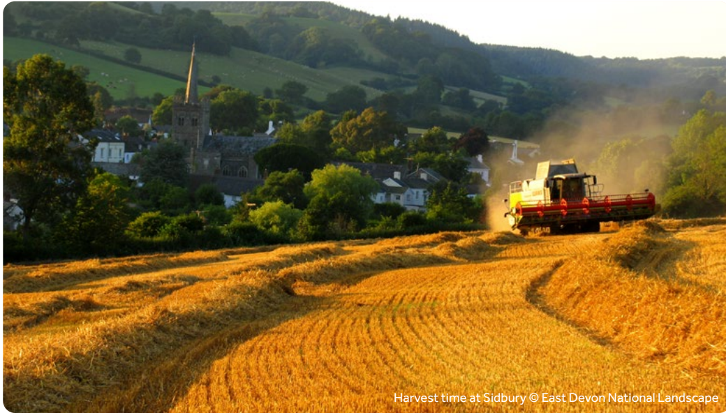
Harvest time at Sidbury