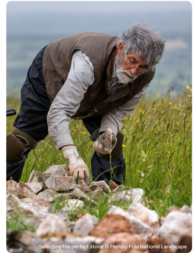
Selecting the perfect stone

The National Landscapes Association is a charity and non-profit membership organisation. The team at the National Landscapes Association advocates, communicates and fosters collaborative action which supports the UK's network of National Landscapes to be as effective as possible. We champion the interests of National Landscapes with governments and coordinate the delivery of national projects.