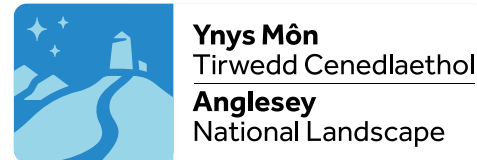
Ynys Môn Tirwedd Cenedlaethol Anglesey National Landscape