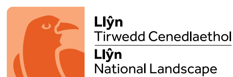
Llŷn Tirwedd Cenedlaethol Llŷn National Landscape