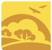
Cannock Chase National Landscape