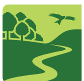
Chilterns National Landscape