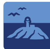
Isles of Scilly National Landscape