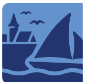
Chichester Harbour National Landscape