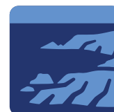
North Devon Coast National Landscape