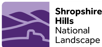
Shropshire Hills National Landscape