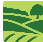
Howardian Hills National Landscape