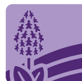
Kent Downs National Landscape