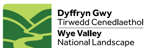
Dyffryn Gwy Tirwedd Cenedlaethol Wye Valley National Landscape