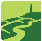
Blackdown Hills National Landscape