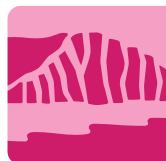
Dorset National Landscape