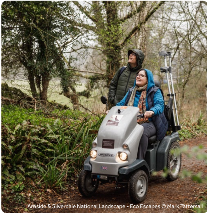
Arnside & Silverdale National Landscape - Eco Escapes