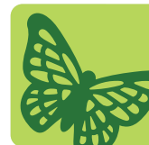
Isle of Wight National Landscape