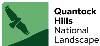
Quantock Hills National Landscape