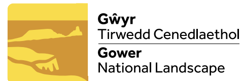
Gŵyr Tirwedd Cenedlaethol Gower National Landscape