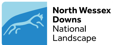
North Wessex Downs National Landscape