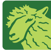
Cotswolds National Landscape