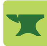
High Weald National Landscape