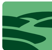
Dedham Vale National Landscape & Stour Valley