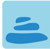
Cornwall National Landscape