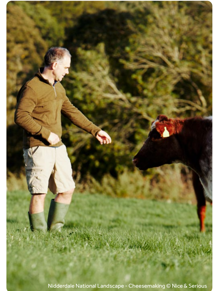
Nidderdale National Landscape - Cheesemaking

We will champion the interests of National Landscapes with governments, and coordinate the delivery of national projects.