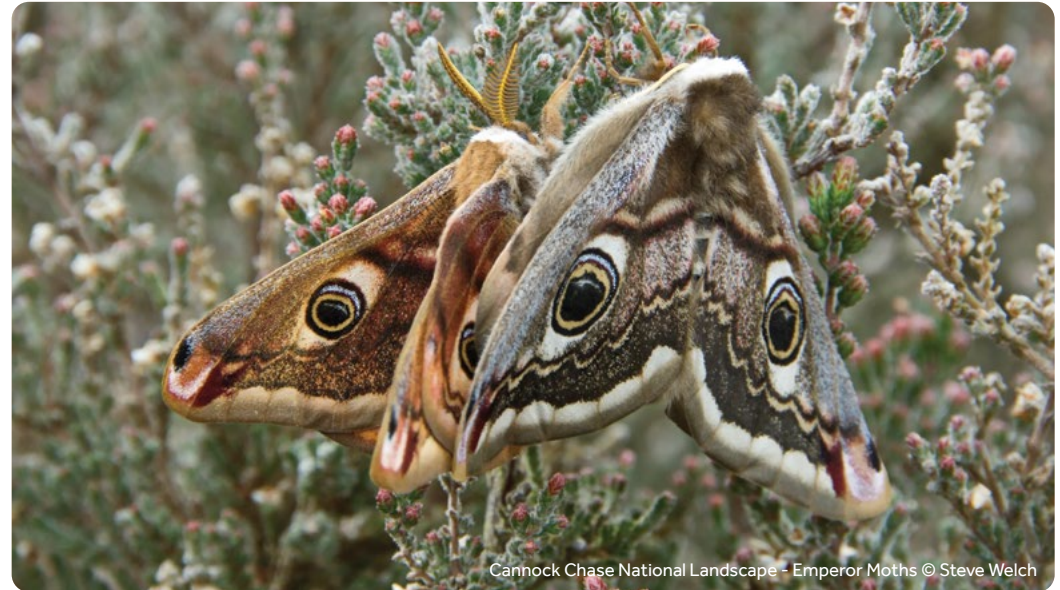
Cannock Chase National Landscape - Emperor Moths