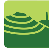
Malvern Hills National Landscape