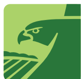
East Devon National Landscape