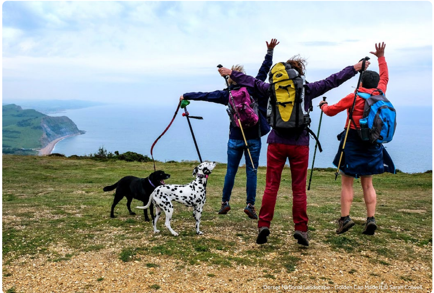
Dorset National Landscape - Golden Cap Made It

We will collaborate with the wider network of protected landscapes, to achieve important outcomes for the nation such as net zero, 30 by 30, sustainable rural communities and wider and more inclusive engagement with nature.