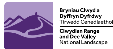
Bryniau Clwyd a Dyffryn Dyfrdwy Tirwedd Cenedlaethol Clwydian Range and Dee Valley National Landscape