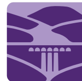
Nidderdale National Landscape