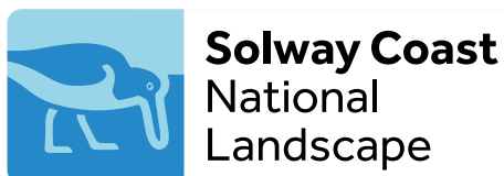
Solway Coast National Landscape