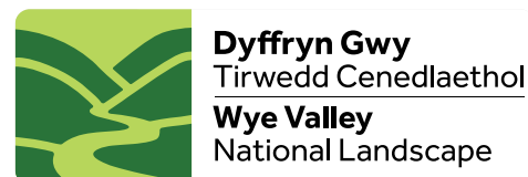
Dyffryn Gwy Tirwedd Cenedlaethol Wye Valley National Landscape