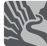
Mendip Hills National Landscape