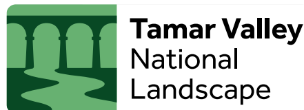
Tamar Valley National Landscape